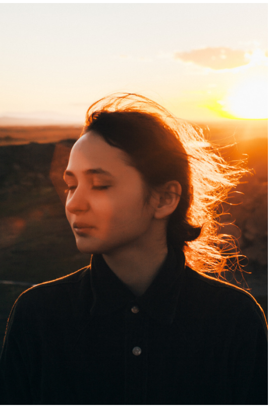
Partially Funded by the Orange County Social Services Agency

Youth ages 11-21 who are in or at risk of trafficking situations